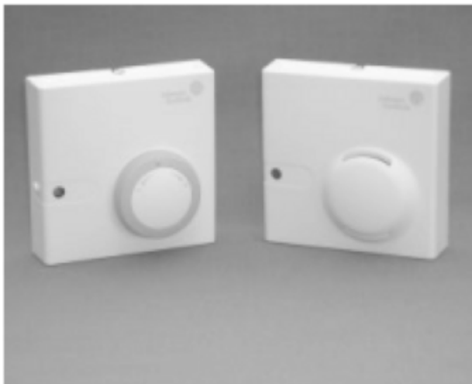
Figure 1. TE-6800 Series Temperature Sensors

Important: Do not remove the Printed Circuit Board (PCB). Removing the PCB voids the product warranty.